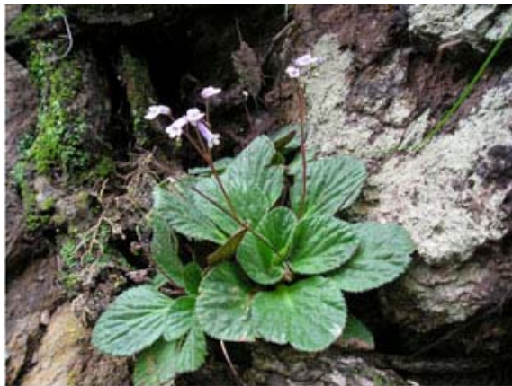
Figure 1. Corallodiscus lanuginosus (Wallich ex R.Br.) B. L. Burt (after Kamble et al. 8 ).

claim of Kamble et al. 8 , Haines collected Didissandra lanuginosa var. minuta from Netarhat, Bihar, which was subsequently transferred to genus Corallodiscus Batalin by Naithani 9 . The genus Corallodiscus Batalin has 18 species described from the Himalayas to northwest China 8 . However, Zheng-Yi and Raven 7 recognize 3–5 taxa in their study. The world check list for Gesneriaceae confirms five taxa under genus Corallodiscus Batalin, including C. lanuginosus var. minuta Naithani. Most of the species excluded were considered to be synonymous with C. lanuginosus , as the delimiting characters used for speciation are found to be continuous and justify a range. These variable characters are the indumentum (amount and type), lamina shape, size, margin and texture, and flower number and size. To facilitate easy identification, a description is provided here (Figure 1).